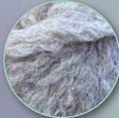
Prince of Tan