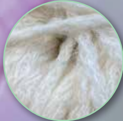
Fluffy White Herself