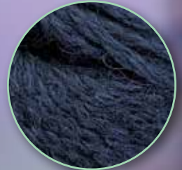
Black of Knight