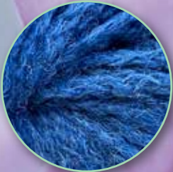
Loopy Dopey Blue

Regular Price: $13.95/skein • Member Price $11.86/skein