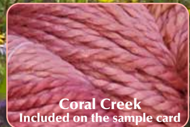
Coral Creek Included on the sample card

Visit our website at www.lambspun.com Click on Savings Club to see photo close-ups of these products and more.