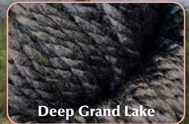
Deep Grand Lake