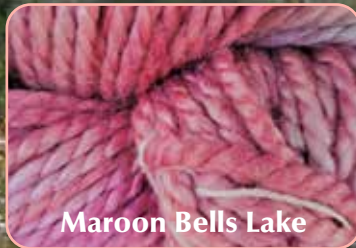
Maroon Bells Lake