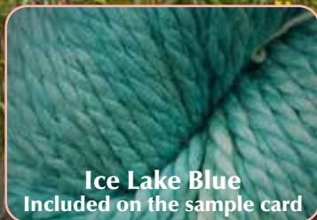
Ice Lake Blue Included on the sample card