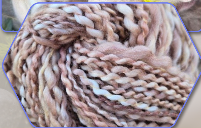
Handspun sample of Garden Wall

These fibers are excellent for spinning or felting! Call us for pricing on hand spinning these fibers into yarns!