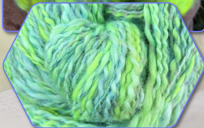
Handspun sample of Secret Garden